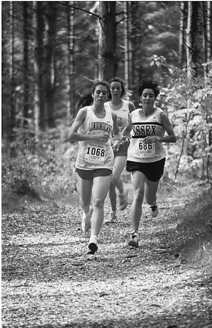
The site of the New England Cross-Country Championship has rotated since 1987 among Connecticut, Vermont, Rhode Island, and New Hampshire. Here, a trio of runners rounds a turn on the 5K course at Thetford Academy, which has been the meet's Vermont site since 1992.